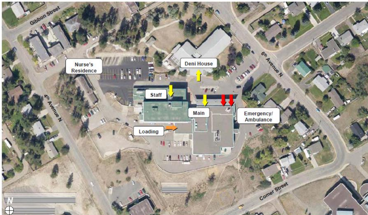
Figure 1: CMH Existing Site

The Project will result in the development of new clinical and support spaces that will be constructed in a new expansion and in renovated space on the existing CMH site (see Figure 1). The major program components include the emergency department, medical/surgical inpatient units, maternal care and women’s health, mental health and substance use (“ MHSU ”) inpatient unit, pharmacy services and University of British Columbia (“ UBC ”) faculty of medicine academic space. Figure 2 outlines the proposed Site redevelopment.